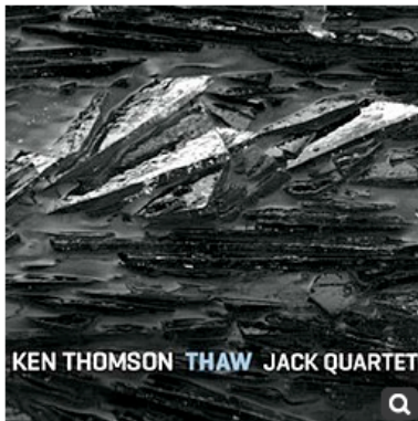
Cover der CD

In diesen Kosmos passt Ken Thomson gut: Er spielt in einer Punk-Jazz Band, in der experimentellen Straßen-Big-Band "Asphalt Orchestra" und er komponiert. Beim Label "Cantaloupe Music" ist eine CD erschienen mit seinen Stücken "Thaw" für Streichquartett und "Perpetual" für Streichquartett und Bass-Klarinette.